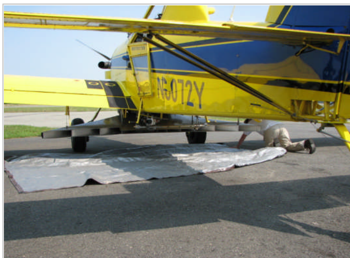
Randy Buchanan makes a final check before removing the tarp under the plane. With the aluminum diverter

A few quick turns of a wrench and attaching all the retainer clips the aluminum diverter was installed on the underside of the plane. More calibration blank was loaded into the plane at the same time a row of buckets were set out along the flight line. Shortly there after Matt flew over the bucket dropping material.