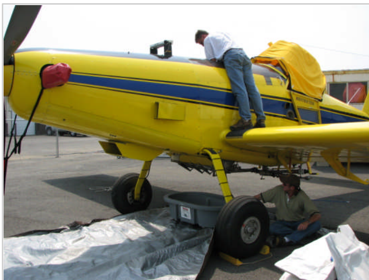
Matt Crabbe on top of the plane levels off calibration blank in the hopper while Jim Andrews sits under the plane and prepares to catch product.

We used a poly stock tank with wheels to collect the calibration blank for reuse. After multiple attempts we were able to consistently deliver all 40 pounds in the 7.6 seconds.