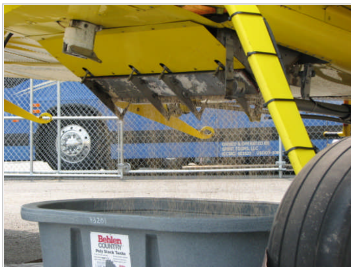
Calibration blank drops out of the plane hopper into the poly stock tank while being timed with a stop watch.