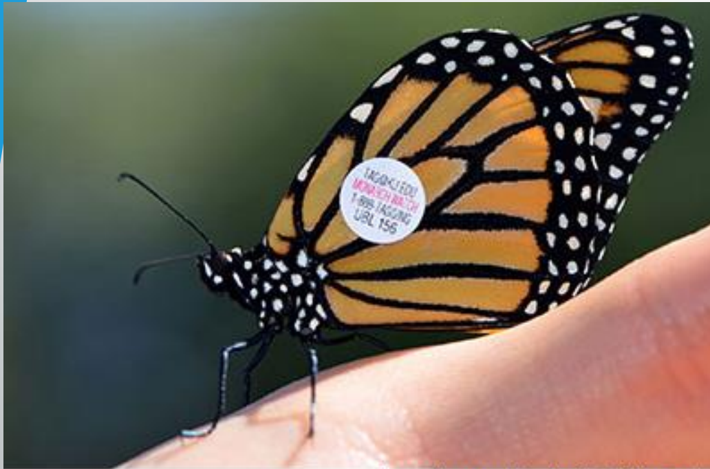
Tagged monarch butterfly in Minnesota.