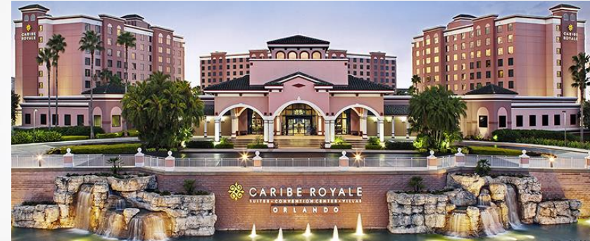
Caribe Royale All-Suite Hotel and Convention Center Orlando, FL

Caribe Royale All-Suite Hotel and Convention Center